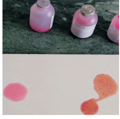
Figure-2. RBPT negative (left) and positive (right)